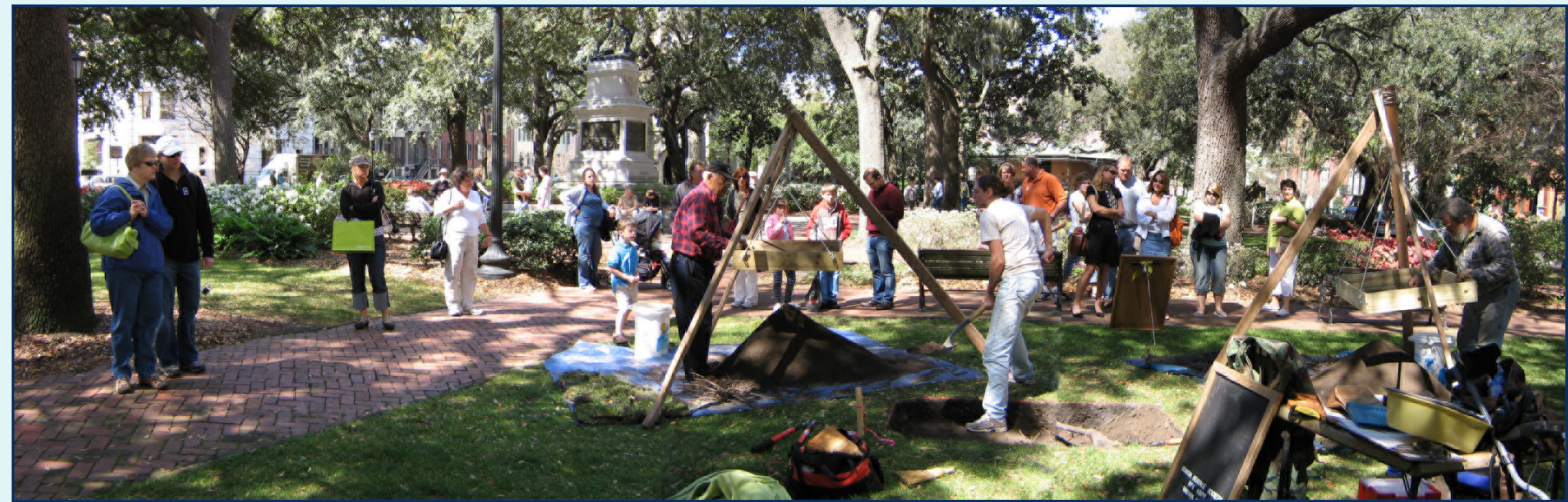
Archaeologists work in Madison Square while tourists and locals observe.

Right: Map showing locations containing Revolutionary War archaeology sites.