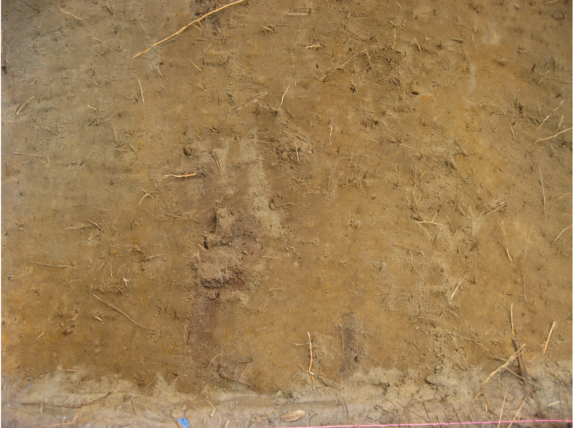
Figure 11. In situ rotted wood stains, Waters Cemetery