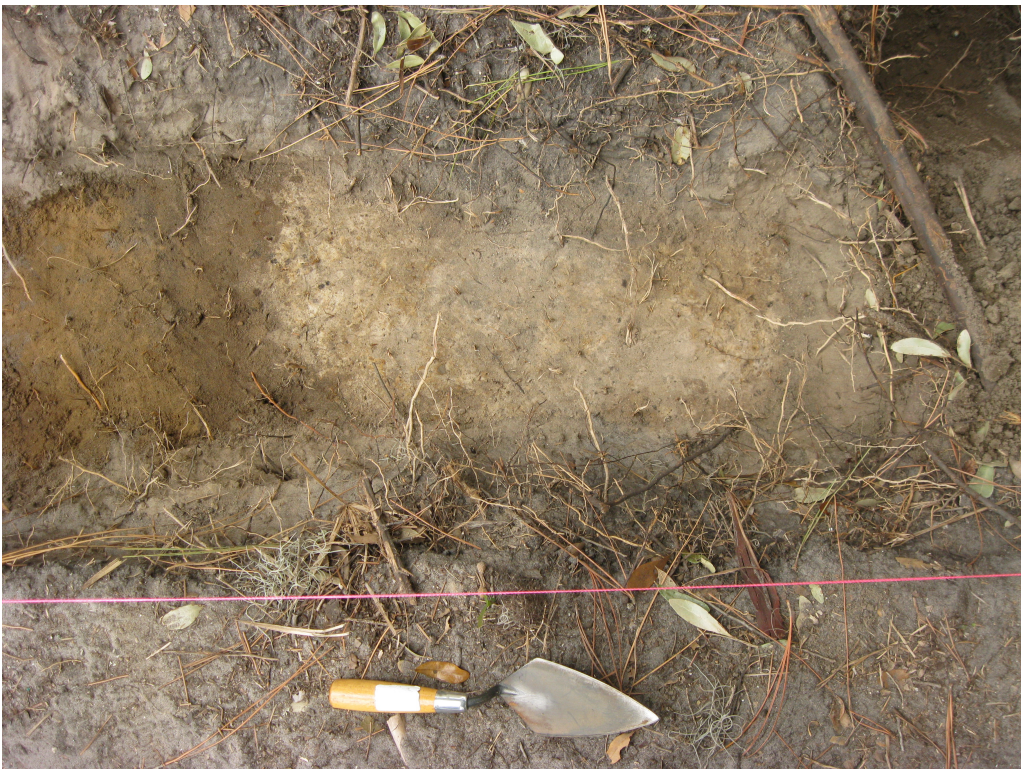
Figure 10. Feature in front of Elcy Waters' gravestone, facing west