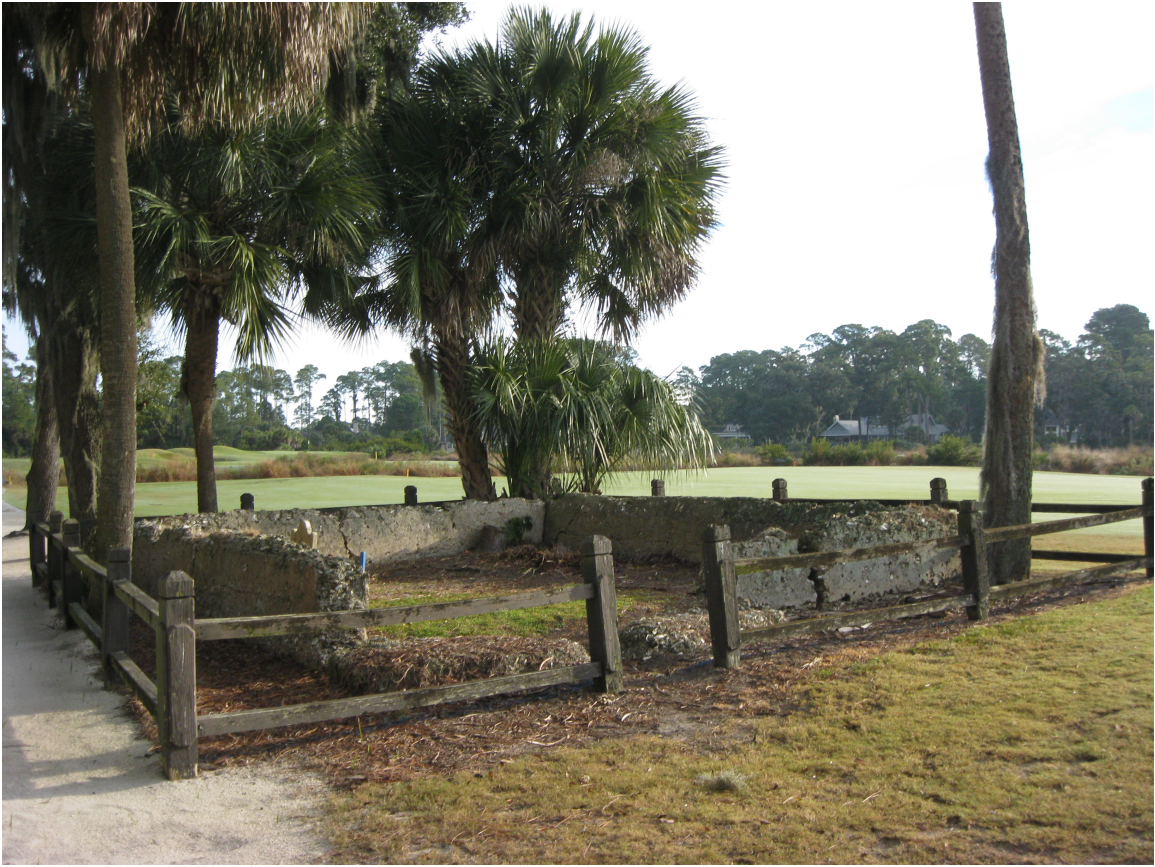
Figure 6. Waters Family Cemetery