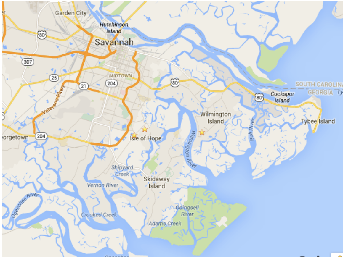
Figure 2. The Savannah area, including Skidaway Island