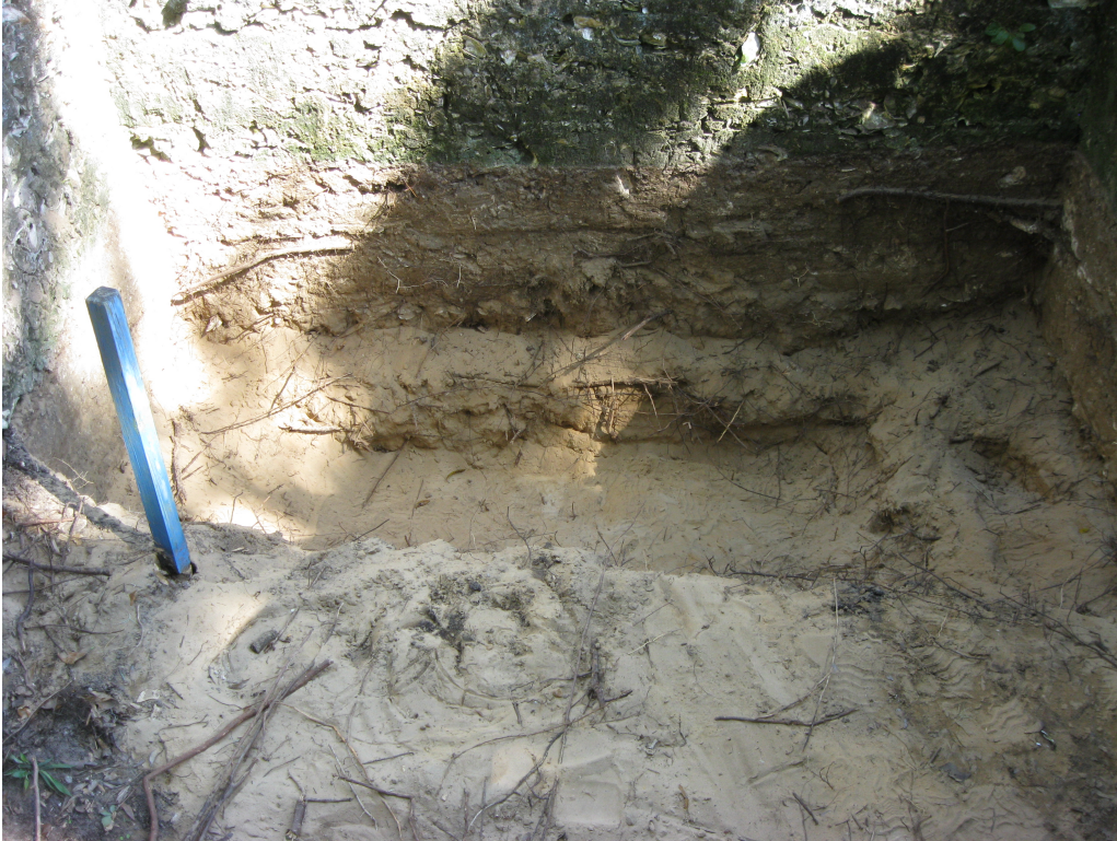
Figure 9. Completed excavation of the Delegal Cemetery, facing east