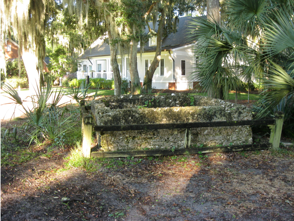
Figure 4. Philip Delegal's grave