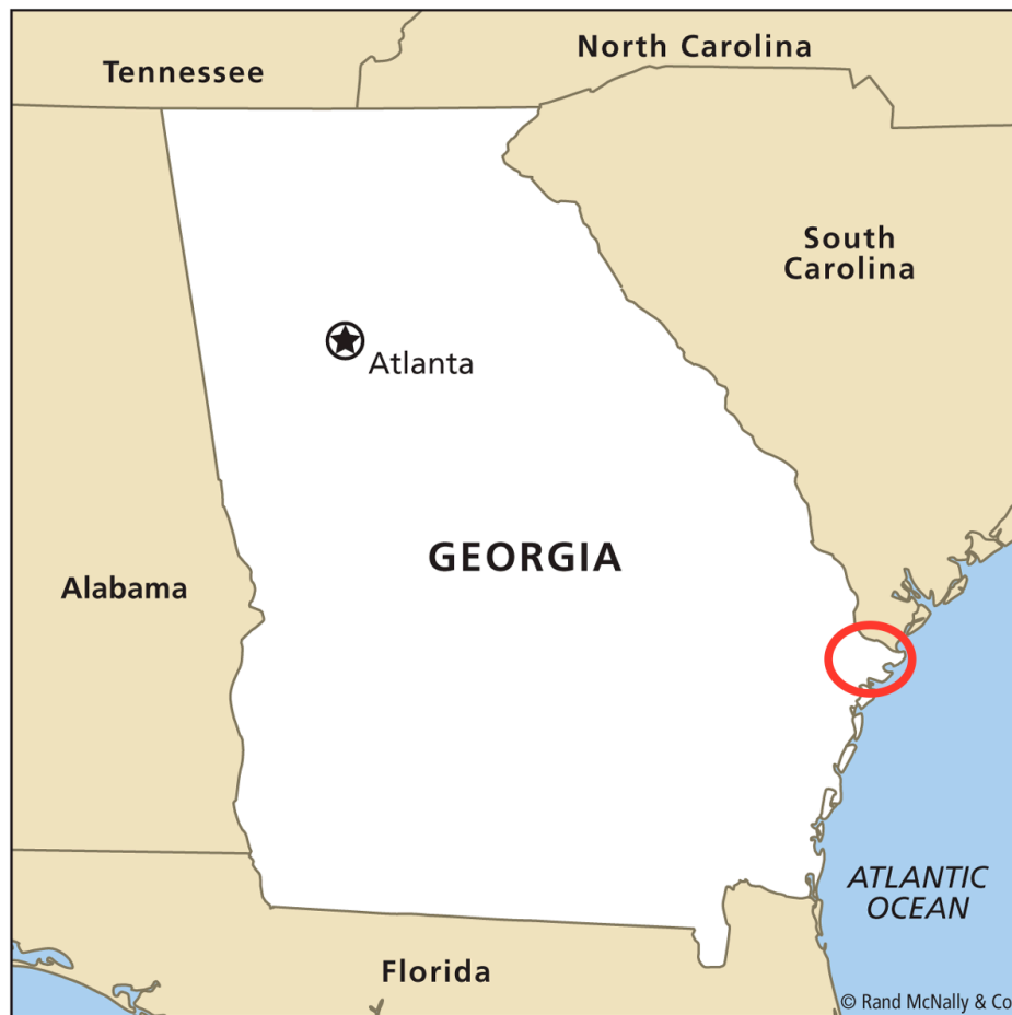
Figure 1. Georgia with the Savannah area highlighted