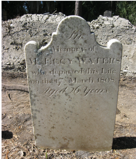
Figure 7. Elcy Waters gravestone in the Waters Family Cemetery