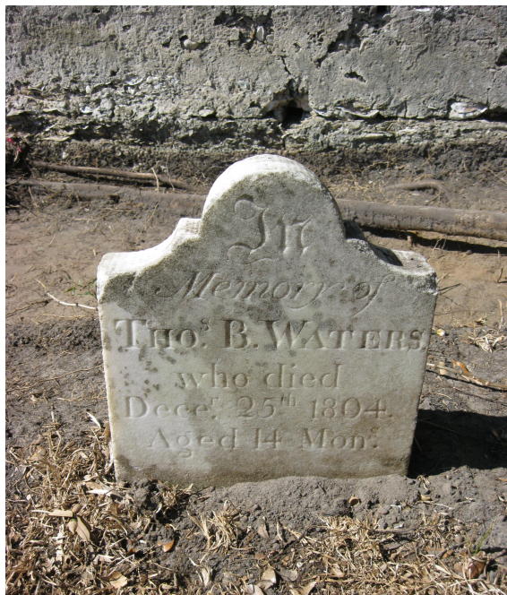
Figure 8. Thomas Waters gravestone in the Waters Family Cemetery